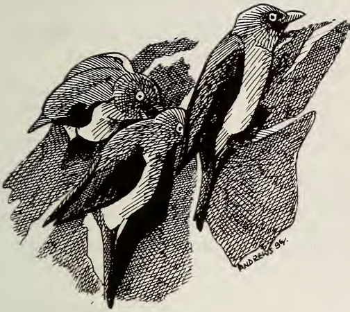
Red-billed Oxpeckers Buphagus erythrorhynchus by Mark Andrews

Telophorus cruentus Rosy-patched Bush-Shrike; status: locally common; rb rec: 2; sites: 2; # zones: 1; zones: 2; month: 10; altitude: 50–150